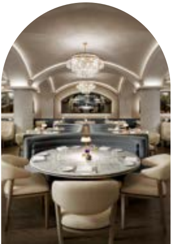
DRUSIE & DARR