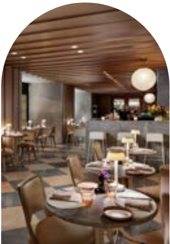
THE PINK HERMIT